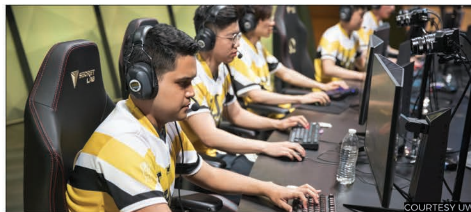
UW Rocket League team finished their season in first place with a 10-2 record.

Best of luck to our UW Warriors as they make their way through the playoffs. Their games are broadcast live at www.twitch.tv/uwaterlooesports .